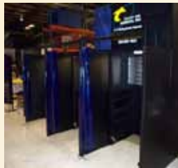
Side Wall Set