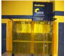
Attachable Weld Curtain