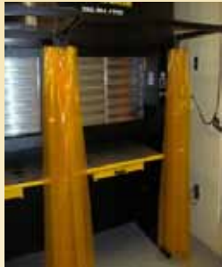
Pullout Tool Drawer